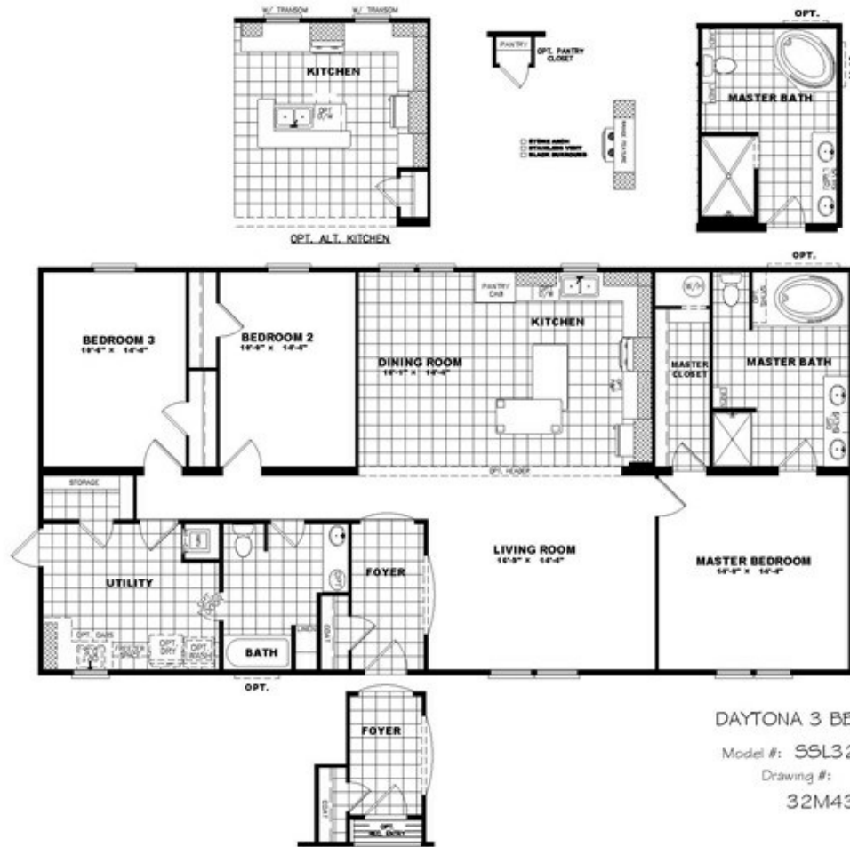
DAYTONA 3 BEDROOM Model #: SSL32604F Drawing #: 32M436

Our home building facilities invest in continuous product and process improvements. Plans, dimensions, features, materials, specifications and availability are subject to change without notice or obligation. Renderings and floor plans are representative likenesses of our homes and may differ from the actual homes. We invite you to tour a Home Center near you and inspect the highest value in quality housing available or call (318) 752-4663 to speak with a Home Consultant. Copyright 2017, CMH. All rights reserved.